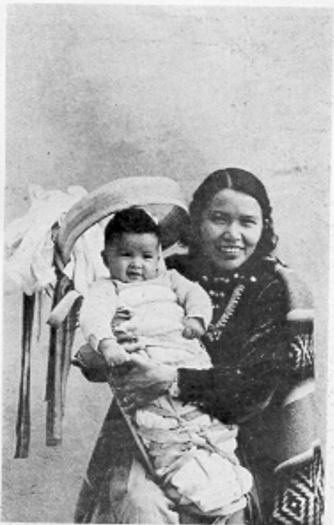
Navajo Mother with Baby in Cradle Board

You can telephone us from Gallup, New Mexico.